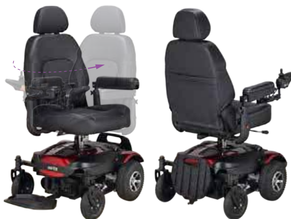
Very easy to convert from rear to front wheel drive: Just release and rotate the chair 180°