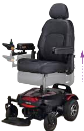
Power seat elevator available. 13cm/5in