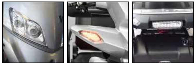
Modern LED lighting system delivers brilliant light with less power consumption