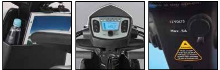
More space for storage