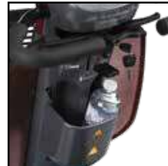
Extra storage & Shopping bag hook.