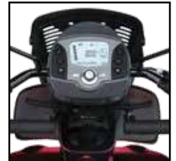
Digital LCD Dashboard Display.