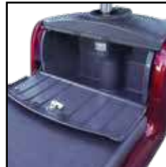
Lockable storage drawer underneath the seat.