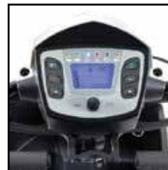
Digital LCD dashboard display