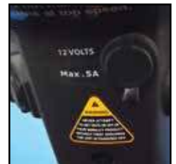
Handy 12 volt socket

Overall Dimension : A x B x C 130 x 69 x 125cm/51 x 27 x 49"