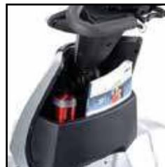
More space for storage