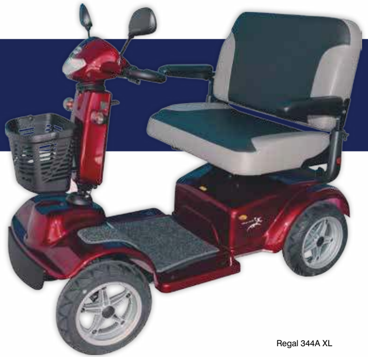
Regal 344A XL