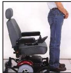
Excellent stability on footplate