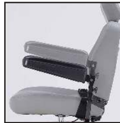
Height adjustable armrest