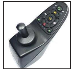
Dynamic Shark Controller