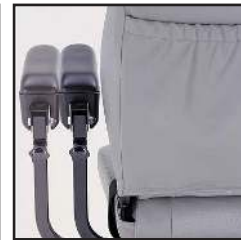
Width adjustable armrest