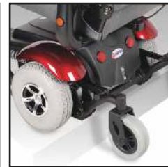
True six wheel design