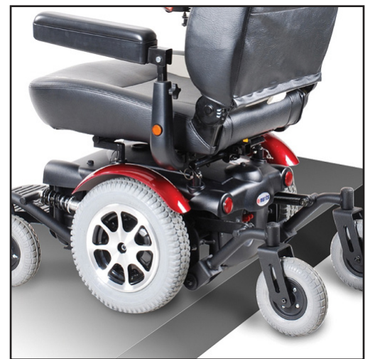
Built to navigate everyday obstacles