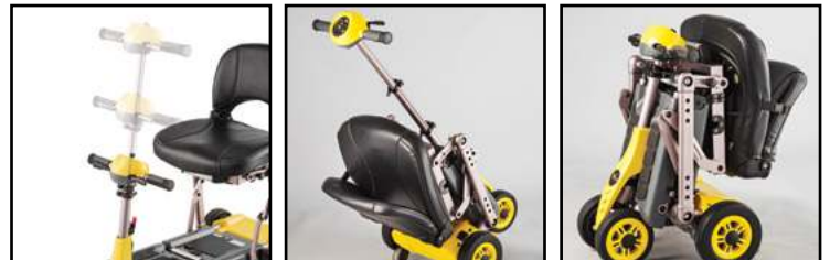
Height adds taller