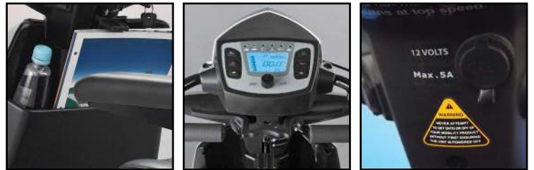
More space for storage