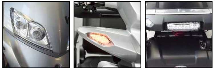
Modern LED lighting system delivers brilliant light with less power consumption